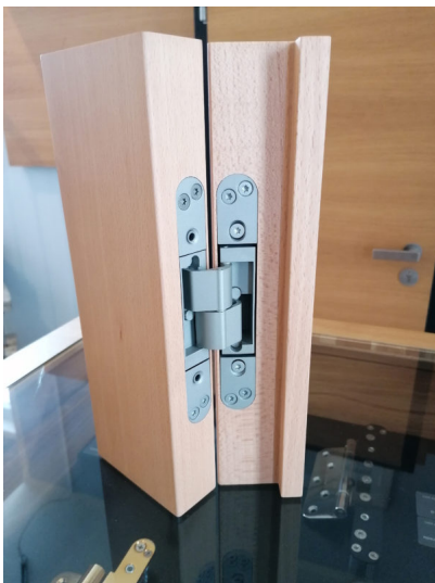
Caption: "Pivota DX 35 3-D LT" is the name of the current and 3-dimensionally adjustable version of a cost-effective entry-level model in the field of concealed hinges for flush doors.

On request, Basys supplies the „Pivota DX 35 3-D LT“ in standard finishes such as „satin nickel plated“ or in RAL colours such as black. Available as accessories are safety plates for case frames and hinge receivers for steel frames.