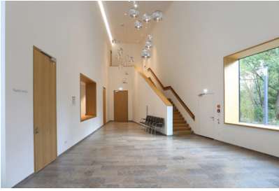
Caption 3: All interior doors in the Tauberphilharmonie Weikersheim are butt-mounted so that the door leaf is flush and harmonious with the frame and wall. Concealed hinges are discreetly discreet and allow the large-scale door design to work on its own.