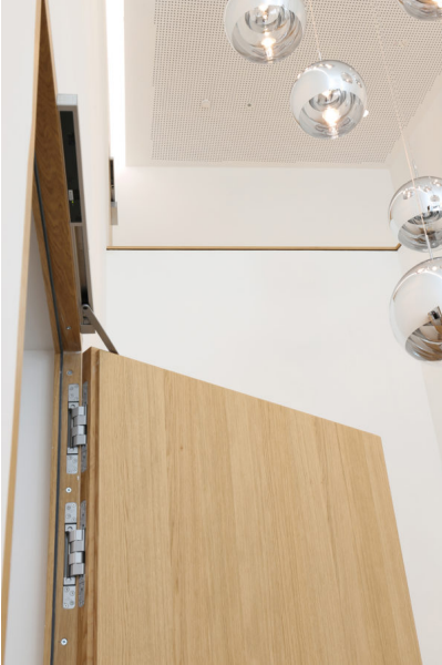
Caption 4 a - c: For oversized fire doors in the Tauberphilharmonie Weikersheim, Neuform relied on the concealed hinge "Pivota DX 300 3-D" from Basys. It has a load-bearing capacity of 300 kilograms per pair, is maintenance-free and can be adjusted three-dimensionally.