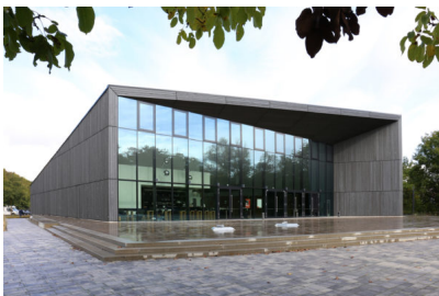
Caption 1: The Tauber Philharmonic sees itself "as a genuine pilot project of an acoustically and architecturally outstanding building away from conurbations". The concert hall opens up new opportunities for the city of Weikersheim and the region to think of culture in a diverse and new way.