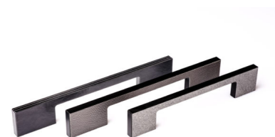
Caption 2: The best part about the new HPL handles: you feel what you see. The highlights include (from left to right) the black slate finish, the textile appearing anthracite-coloured relief and the concrete look.