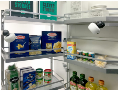
Caption 2: Modular built-in cameras and a practical app let users check the contents of their food storage centre at any time from any location. Kesseböhmer has developed special camera brackets for the "Tandem", which with its clear-view design is especially suited for integration in a smart home system.