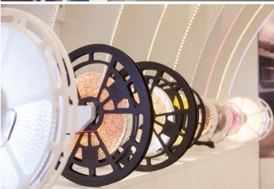
Caption 5: For D-Leuchten, the 20-metre long low-voltage (24 V DC) strip lights that can be reduced in length in five centimetre increments have become a highlight.