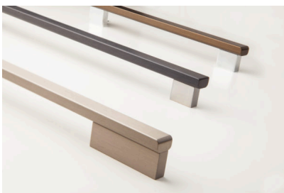
Caption 1: The bar handles, based on a modular principle, provide a multitude of possibilities for individualising furniture and reacting flexibly to trends.

For D-Leuchten, a division of D-Beschlag GmbH, the 20-metre long low-voltage (24 V DC) strip lights that can be reduced in length in five centimetre increments have become a highlight, in particular amongst shop-fitting and interior designers. D-Beschlag has secured the sales rights in Europe. In addition, D-Leuchten will be showcasing new and further developments within its „D-Puc“ built-in lights range. The „D-Puc Star“, the „D-Puc II“ and the „D-Puc Saturn“ are winners with improved illumination, a greater wattage and new finishes.