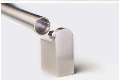
Caption 2: D-Beschlag will be showcasing bar handles that are hollow throughout. These tubular handles are surprising with their considerably reduced weight, which, in particular in the wall unit area, will relieve the strain on the fitting technology.