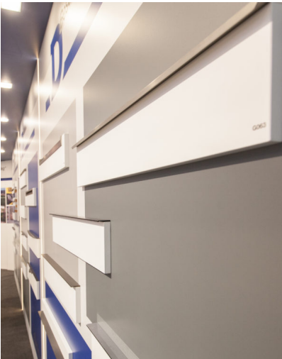
Caption 4: The mottos 'industrial design' and 'vintage' are driving the current surface finish trend. Because aluminium can be finished in many different ways, the aluminium handle ledges from D-Beschlag cater to any colour and surface trend.