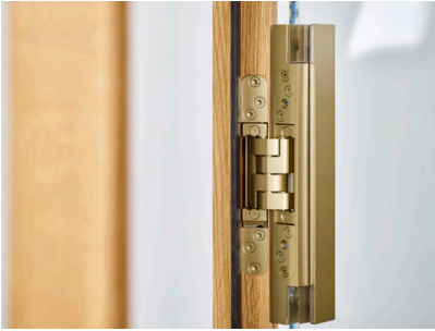
Caption 3: The centrepiece of the "Pivota DX" hinge series is the patented design principle with a symmetrical four-knuckle joint that transmits the forces from the door wing evenly to the frame. Magnetically attached design covers ensure a screw-free look.