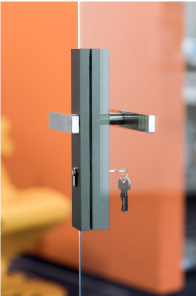
Caption 4: The design of the decorative fitting and the lockable lock case, which makes it suitable for project usage, takes on the look of the hinge retainer. Because they are produced in solid aluminium, they offer a variety of surface finishing options.