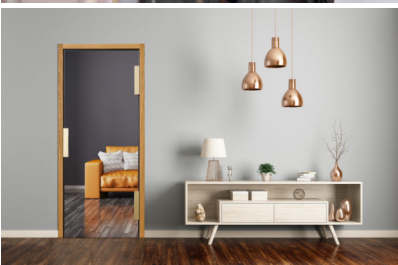
Caption 2: Basys has expanded its "Pivota DX Glass", developed for glass doors, into a system. Together with the lock as well as lock retainer and handle, the hinge with hinge retainer forms a unit. The components are designed to match each other and fit flush with the frame and face.