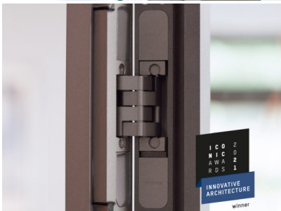
Caption 2: Basys will receive one of the coveted Winner awards at the "Iconic Award 2021: Innovative Architecture" for the concealed glass door hinge "Pivota DX Glass".