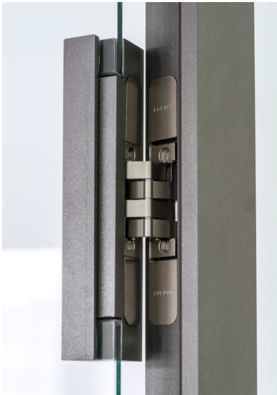
Caption 1: Hardware technology should appear as invisible as possible and ensure a puristic look. This applies all the more when filigree glass comes into play as a material. So it seems paradoxical at first to hide the technology even in a glass door. Basys has accepted this challenge and developed the "Pivota DX Glass".

The German Design Council acts as one of the world's leading centres of excellence for design and architecture at the interface between designers and the building industry. Its awards are regarded as independent seals of quality of international standing for contemporary developments and design achievements. Basys will receive the „Iconic Award 2021: Innovative Architecture“ on 11 October 2021 during Expo Real in Munich at the “Pinakothek der Moderne”.