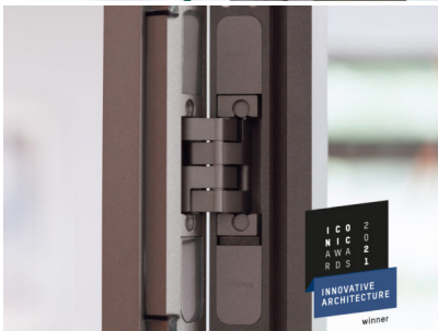
Caption 2: Basys will receive one of the coveted Winner awards at the "Iconic Award 2021: Innovative Architecture" for the concealed glass door hinge "Pivota DX Glass".