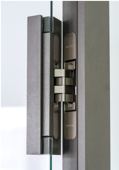
Caption 1: Hardware technology should appear as invisible as possible and ensure a puristic look. This applies all the more when filigree glass comes into play as a material. So it seems paradoxical at first to hide the technology even in a glass door. Basys has accepted this challenge and developed the "Pivota DX Glass".

The German Design Council acts as one of the world's leading centres of excellence for design and architecture at the interface between designers and the building industry. Its awards are regarded as independent seals of quality of international standing for contemporary developments and design achievements. Basys will receive the „Iconic Award 2021: Innovative Architecture“ on 11 October 2021 during Expo Real in Munich at the “Pinakothek der Moderne”.