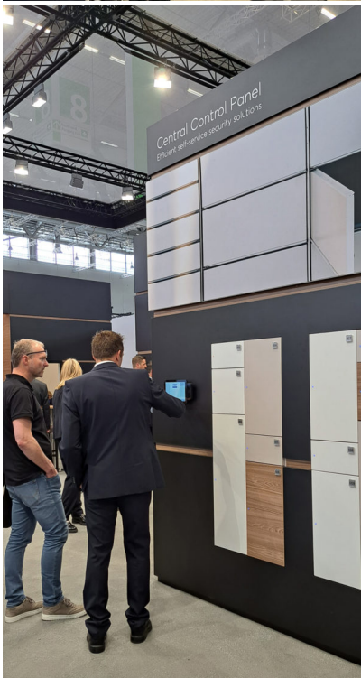
Caption 2: Lehmann's "Central Control Panel" extends the benefits of interconnected systems to include the ability to self-manage lockers on an intuitive basis. Following the principle of the "Packstation", parcel drop-off station, users can select and use their locker with no outside help via the central terminal's touch display using an RFID transponder.