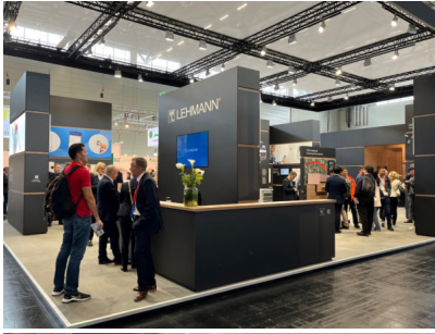
Caption 1a + b: During the international trade fair for the furniture supplier sector and interior design industry, some 20 per cent more visitors were interested in Lehmann's stand than in 2019.