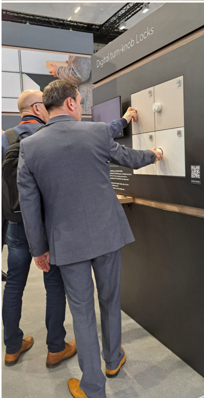
Caption 4: Displaying "Giro RFID MIFARE" and the keypad "Giro TA" option, Lehmann used interzum to present two new battery-operated turn-knob locks as an electronic solution for the 16 x 19 aperture. Key aspect in talks with customer: the battery is changed externally.