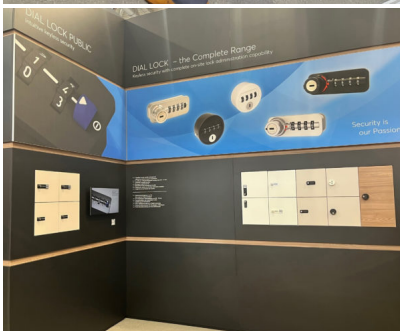
Caption 5: Big on dial locks: Lehmann showcased the entire range at interzum 2023. Pictured on the left, "Dial Lock Public". The optimised operating concept behind this freecode dial lock simplifies application for users and facility managers alike.