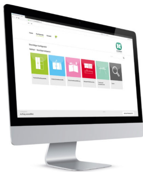
Caption 1: Kesseböhmer has now created an easier facility for quick and easy computer-aided design of furniture with its fittings systems. The company is presenting a new CAD portal integrated into the relaunched website at Sicam.

A new, multilingual and constantly updated training portal will offer technical training to the kitchen business segment anytime and anywhere.