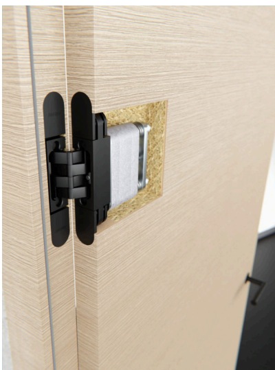
Caption 1: With the concealed hinge "Pivota DXS Close" doors close gently and automatically. Version 2.0 is equipped with a steel joint and an associated closing mechanism that, like the hinge, disappears into the door milling. In contrast to the original version, the "Pivota DXS Close 2.0" is somewhat more compact, resulting only in a larger cut-out in the door leaf.

With the update, Basys primarily solves problems that were associated with the purchased gas tension spring. The new design is produced directly in the hardware manufacturer's factory in Kalletal. It is designed for long-lasting and maintenance-free operation with constantly reliable tension and closing force. In addition, the „Pivota DXS Close“ ensures that the door opens smoothly without resistance.