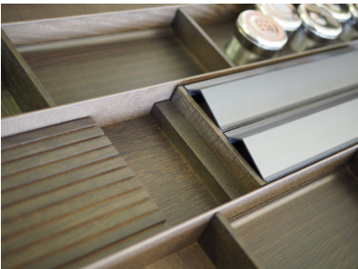
Caption 3: Anodised in titanium colour, the new foil/film roll cover harmonises perfectly with "Ash Umbra".