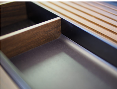
Caption 1: Small, yet exquisite details define the inspiration that comes from Holzwerk Rockenhausen. The radius of the new cutlery trays blends harmoniously with the aluminium trims. Classy smoked oak is combined with cool, black anodised aluminium.

For Holzwerk Rockenhausen, the trade show appearance at SICAM is an integral part of its business model in a bid to involve customers in its product development processes and generate exclusive solutions. This close cooperation is what allows the company to create tailor-made furnishing systems that meet the high requirements for design, quality and function.