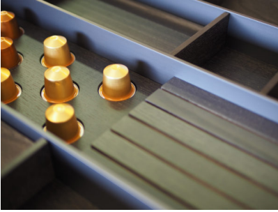
Caption 5: Besides unique design, the focus at Holzwerk Rockenhausen is also on practical functionality. At Sicam, the company is showcasing a variety of different functions.