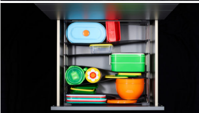
Caption 2: The stored goods can simply be inserted between the dividers and intuitively sorted or nested. nesttex adapts itself to any container geometry and to the pull-out itself thanks to its elasticity. Everything can be held in place between the flexible webbing – without clattering or slipping around.