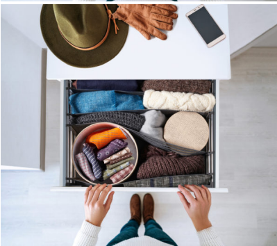
Caption 4d: SpaceFlexx is proving to be as flexible as its users and is ideal wherever order needs to be restored amongst chaos, for example, in wardrobes.