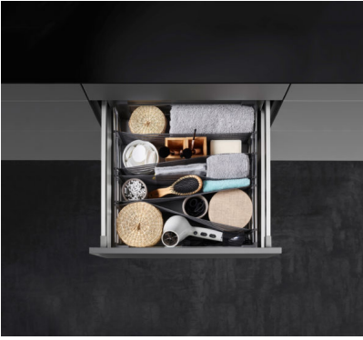
Caption 4b: SpaceFlexx is proving to be as flexible as its users and is ideal wherever order needs to be restored amongst chaos, for example, in the bathroom.