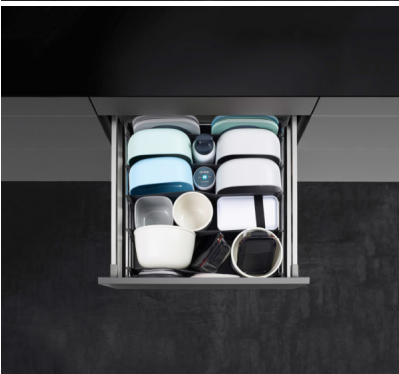
Caption 1b: ... it is the new solution to stowing storage containers of different shapes and sizes in pull-outs – saving space and providing clarity.