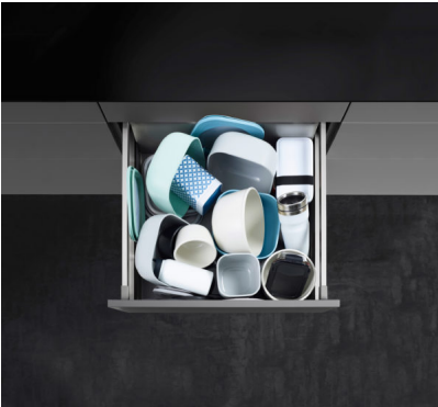
Caption 1a: SpaceFlexx has brought the chaos of storage containers in pull-outs to an end: ...

https://www.clever-storage-shop.de/produkt/spaceflexx/