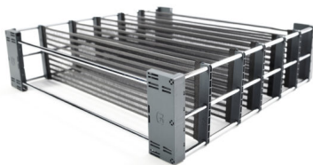
Caption 3: SpaceFlexx is a retrofittable modular system that is easy to assemble without tools and fits in all pull-outs with a front panel width from 60 cm. A framework of chrome-plated metal struts and plastic components connects five innovative horizontal strips of high-tech webbing that can be moved along the struts.