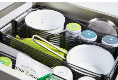
Caption 4a: Initially, Kesseböhmer aimed SpaceFlexx at the kitchen.