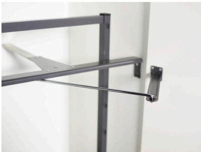
Caption 3: The door connector for the “Tandem solo” has been redesigned. As standard the connector is now made of chrome-plated round wire which looks more delicate and elegant. The redesigned fixed crosspiece also contributes to the overall harmonious and contemporary look. Rubber buffers in the control levers help to make opening and closing noticeably quieter.