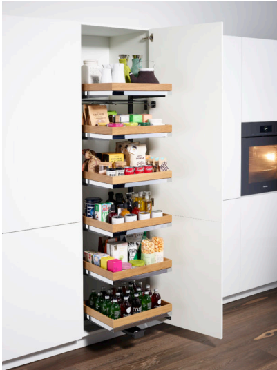
Caption 1: With the new “Arena select” trays, Kesseböhmer has created trendsetting pairings of wood and metal. The trays are now available for use with the “Tandem solo” storage fittings.