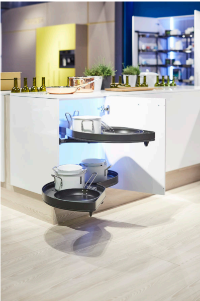
Caption 2: The new “Arena pure” tray variant for its “LeMans” corner pull-out will be available from 2018.