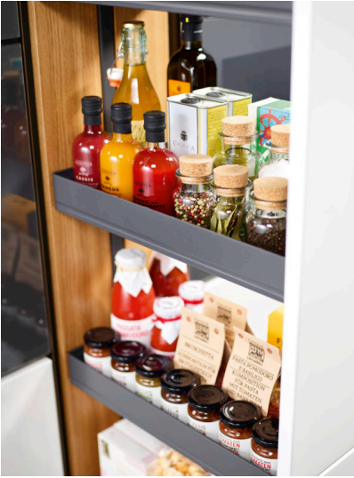
Caption 1: The new trays are also right for the “Dispensa” tall larder pull-out and the “Dispensa junior III” base unit pull-out as well as for the “Tandem” and “Tandem solo” storage fittings.