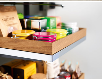
Caption 3: The new “Arena select” tray has been developed for use in the Kesseböhmer “Tandem”, “Tandem solo” and “Convoy” storage fittings. It is an extraordinarily successful and harmonious mix of wood and metal.