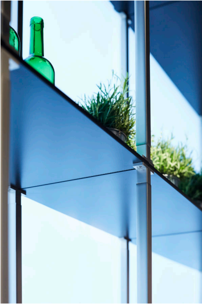
Caption 2: With choices all along the line – of surface finishes, shelf materials and especially the colour of the metal profiles and connectors – the tRack is a contemporary response to today's yearning for individuality and a creative blend of design flair and practicality in personal living spaces.