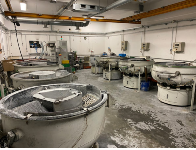
Caption 3: Schwinn plant in Krakow/Poland: Vibratory finishing/trowalising.