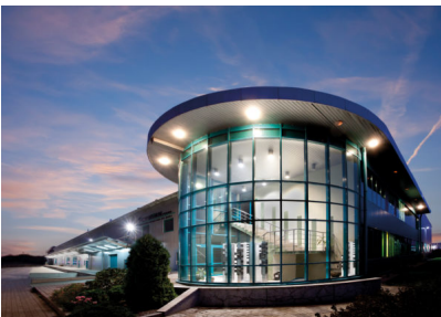
Caption 1: Schwinn plant in Krakow/Poland.

At Interzum, Schwinn will be giving its visitors an insight into the production process on site with pictures and hands-on exhibits and will be showing examples of how a handle is made from zamak, how it is finished in an energy-saving and environmentally friendly way and finally how it is packaged. Around 1.4 million ornamental fittings currently leave the factory in Poland every month.