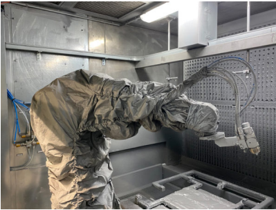
Caption 5a and b: Schwinn plant in Krakow/Poland: Powder coating.