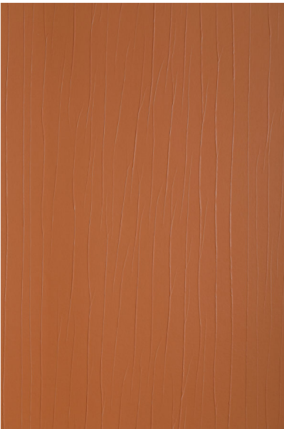
Caption 3: Homapal offers the entire collection in fire retardant IMO quality as standard. "8514_03 – Cognac Lounge Plus" is the ideal choice for adding an elegant appearance.