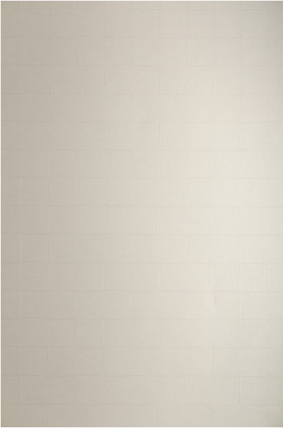
Caption 2: "8511_02 - Creme". "Square" is one of three leather surfaces that feel soft and authentic.