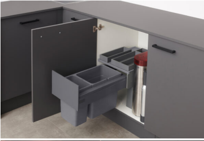
Caption 1: Combines waste and water management in the sink base unit: "one2eight" from Ninka.