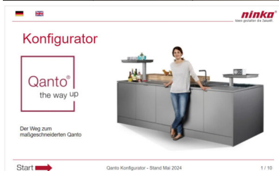
Caption 3a: The configurator takes you to your customised "Qanto" in nine steps.