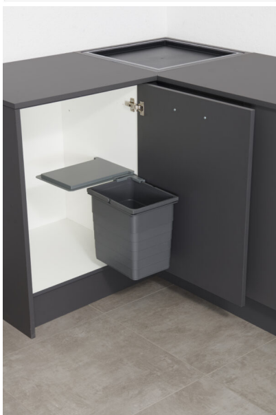
Caption 4: "one2nine", Ninka quality in a classic compact bin format.