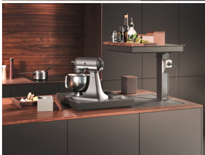
Caption 2: The "Qanto" linear vertical system, which opens up the full storage space in kitchen corners and islands, but also in living room cupboards, can be customised in terms of convenience and design.