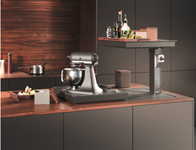
Caption 2: The "Qanto" linear vertical system, which opens up the full storage space in kitchen corners and islands, but also in living room cupboards, can be customised in terms of convenience and design.