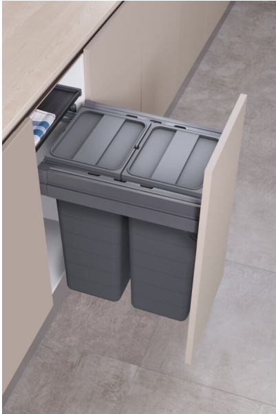
Caption 5: 25.5-litre waste bins, which can also be used in combination with the "one2five" hanging frame system in 40 cm base units.