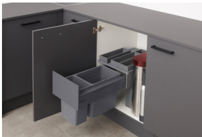
Caption 1: Combines waste and water management in the sink base unit: "one2eight" from Ninka.