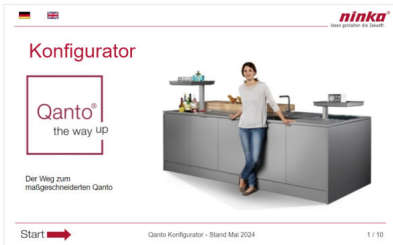
Caption 3a: The configurator takes you to your customised "Qanto" in nine steps.