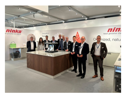
Caption 1: Ninka once again presented itself at Sicam 2024 as an outstanding partner for functional and integrated solutions inside kitchen cabinets.

Ninka was also creative when it came to the "one2top" range of bin lids and inserts: from organic waste lids with coconut mat odour filters and visually appealing metal inserts, which are particularly popular in Italy, to tidy organisation solutions with dustpans, hand brushes and cloth hangers – variety was the order of the day at the supplier trade fair for the furniture and interior design industry, which was once again very popular.