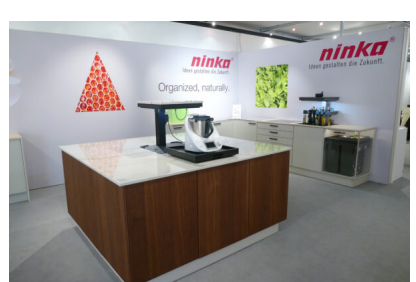
Caption 2: The complete base unit "Qanto", which Ninka had placed in the centre of a huge kitchen island, proved to be an attractive eye-catcher Photo: Ninka