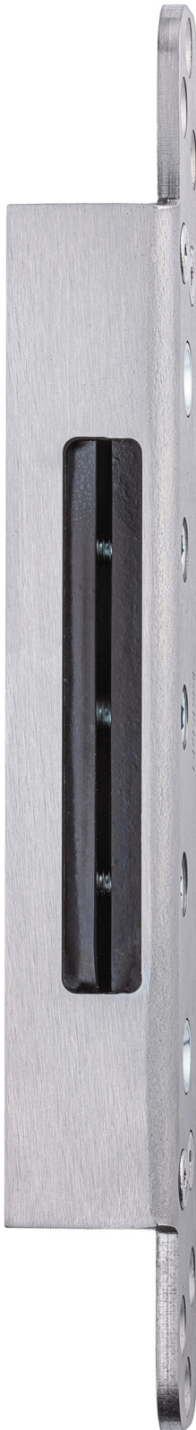
Caption: Basys has now equipped the slot of the hinge receiver "STV 135/56 3-D" for door weights of up to 350 kilograms per pair with a sealing lip so that rainwater cannot penetrate the doors in the building shell.