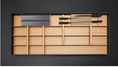
Caption 2g: HoLite.