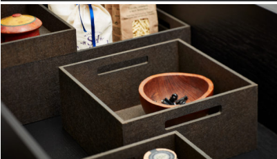
Caption 1f: EasyLine.