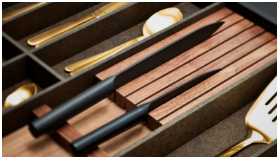
Caption 1b: EasyLine.