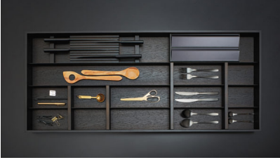
Caption 2f: HoLite.