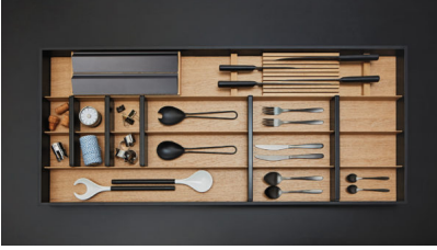
Caption 2h: HoLite.