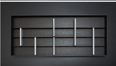
Caption 2b: HoLite.