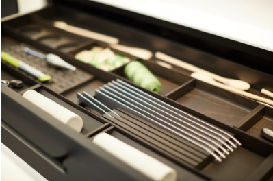
Caption 3: CombiLine horizontal.