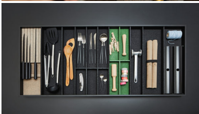
Caption 1c: EasyLine.