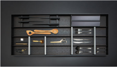
Caption 2c: HoLite.