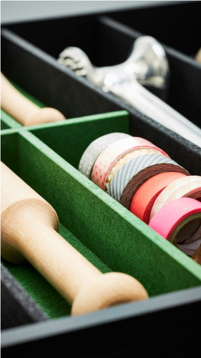
Caption 1d: EasyLine.