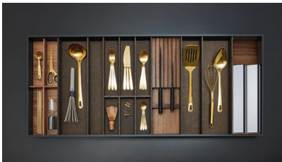
Caption 1a: EasyLine.

“CombiLine” is the expression of the idea of carrying the trendy horizontal alignment of the front panels on oversized drawers and pull-outs through to the inside. Dark grey anodised aluminium crosspieces draw attention to the horizontal division inside drawers. Various trays, universal racks, chopping boards, foil holders and knife blocks that can be used on either side organise the contents flexibly. „CombiLine“ for pull-outs is based on a grooved plate. Round plugs, H-frames, L-brackets, holders for bottles, foil and storage containers plus lots of other clever elements can be placed individually into the horizontal grooves.