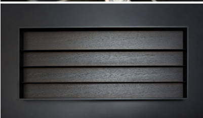
Caption 2a: HoLite.