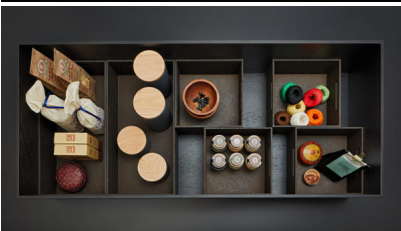
Caption 1e: EasyLine.