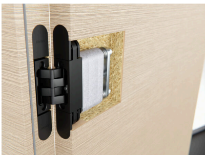
Caption 1: The door closer works together with the hinge and disappears into the door leaf: with the concealed hinge "Pivota DXS Close 2.0", doors close gently and automatically.

The door can also be opened up to an angle of 180 degrees with little effort, which makes it easier to operate, especially for the elderly and children, but also for those who only have one hand free or none at all. With a one-meter-wide door leaf, the maximum operating force of the „Pivota DXS Close 2.0“ is only 6.9 Nm, and only at an opening angle of 90 degrees.