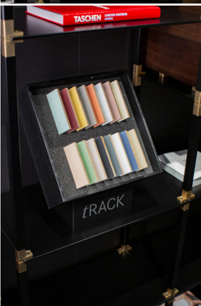
Photo: Volume K by Kesseböhmer