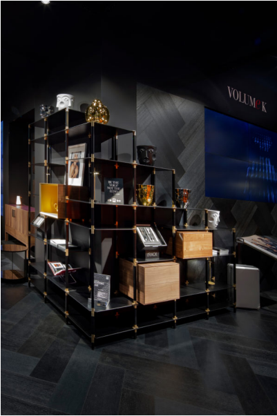
Photo: Volume K by Kesseböhmer