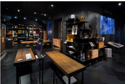
Photo: Volume K by Kesseböhmer