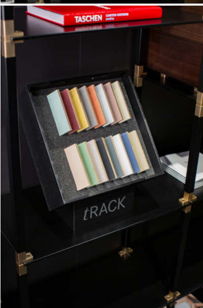
Photo: Volume K by Kesseböhmer