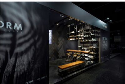
Photo: Volume K by Kesseböhmer