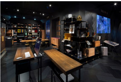
Photo: Volume K by Kesseböhmer