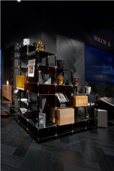
Photo: Volume K by Kesseböhmer